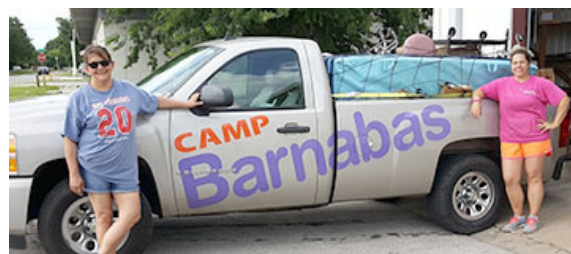
Camp Barnabas of Missouri received over 700 lbs of supplies and equipment from MSNI.