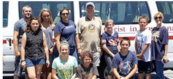
First Los Lunas Baptist from New Mexico worked 2-4 hour days at MSNI as part of their summer mission.

Rotarians from Districts 6110 and 6190 gather at LifeShare Blood Centers in Shreveport, La, where unused medical equipment was donated to Medical Supplies Network, Inc.