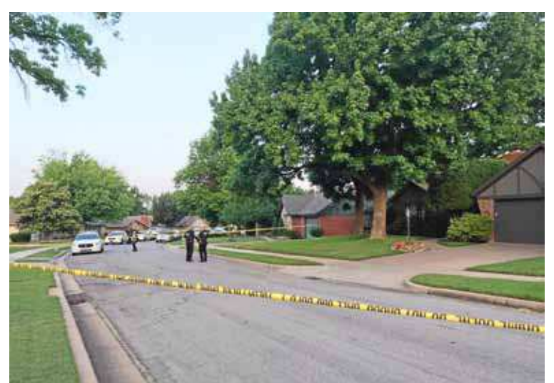
Homicide detectives investigate at a home in the 7000 block of East 52nd Street where an elderly man was shot and killed in a home invasion.

The shooting was Tulsa's 18th homicide of 2018.